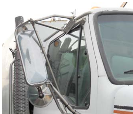
Damage to ID truck due to encroaching branches.